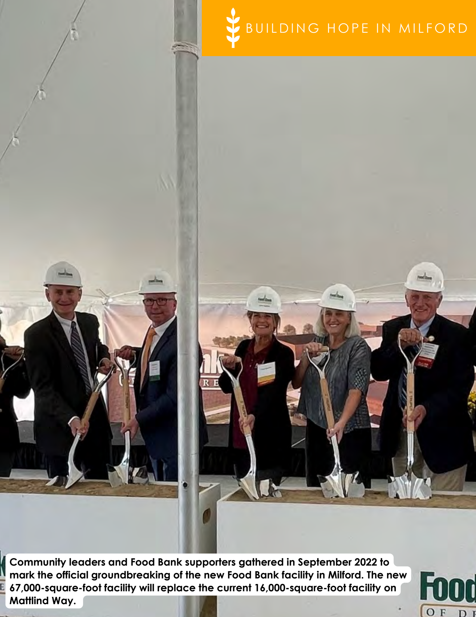
Community leaders and Food Bank supporters gathered in September 2022 to mark the official groundbreaking of the new Food Bank facility in Milford. The new 67,000-square-foot facility will replace the current 16,000-square-foot facility on Mattlind Way.